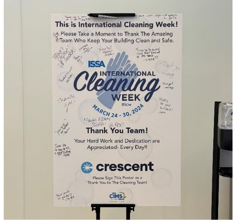
Picture: Monroe Team Poster