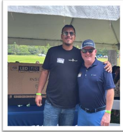
50" Smart Tv Rolando Pena